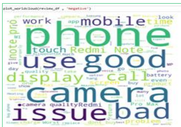
Fig 9: Word cloud for negative reviews