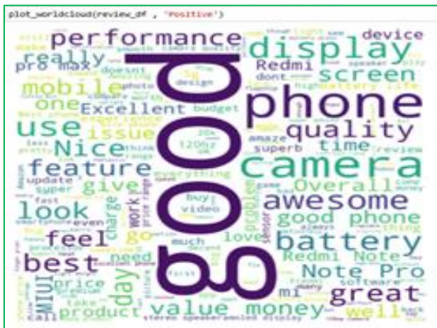
Fig 8: Word cloud for positive reviews

In Fig 6: it is more clearly shown the total review process. First it shows the polarity rating (negative or positive) of the review then it analysis sentence wise and the part of the negative, positive and neutral sentiment of each review sentence. At last column it represents the total sentiment score of the review. From the Fig 7: it is observed that the compound sentiment and the polarity rating give the same information on each customer's review. If both the information (rating and text) not match then we may consider that the customer does not give accurate review on the said product.